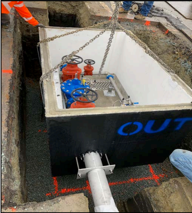
Completed Project: Casa del Mar Pressure Management Project

Coastside County Water District is committed to providing our customers with reliable, high-quality drinking water and services, while maintaining its facilities and infrastructure. The District's capital improvement program provides that the District's infrastructure is replaced at the end of its life cycle and upgraded to meet current water industry standards.