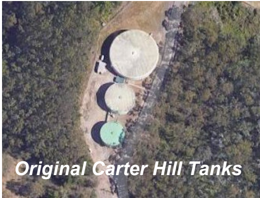
Original Carter Hill Tanks