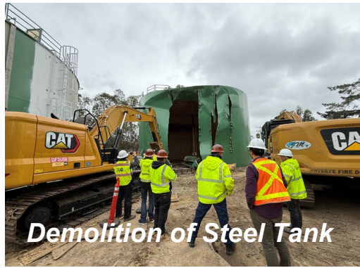
Demolition of Steel Tank