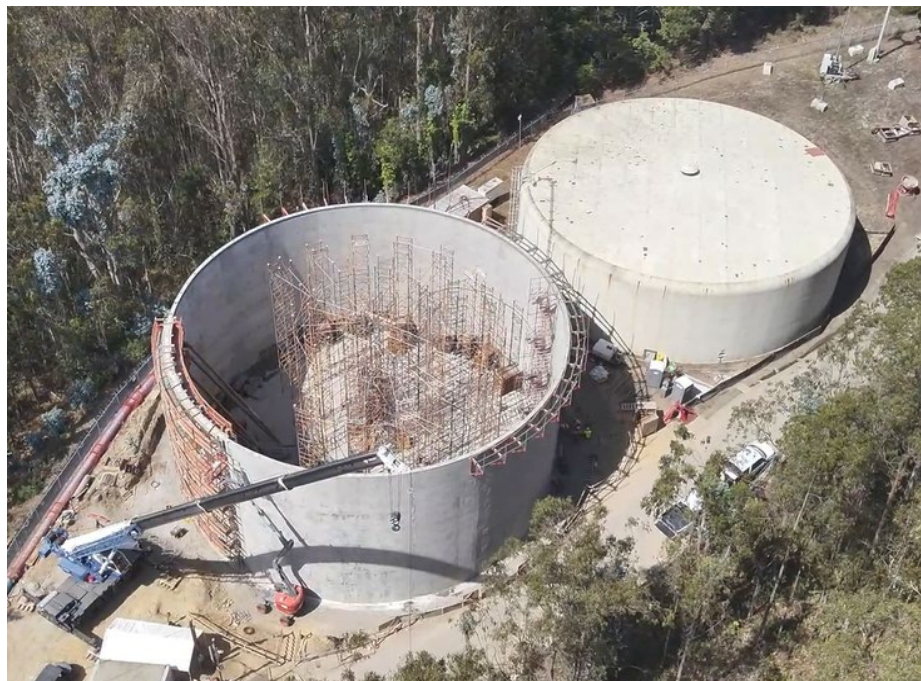
Carter Hill Tanks

Images of new 2.1 million gallon concrete tank with the original 1.5 million gallon steel tank. Two of the original three Carter Hill Tanks were removed.