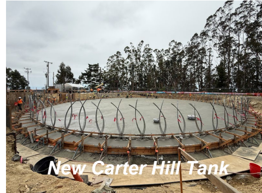
New Carter Hill Tank